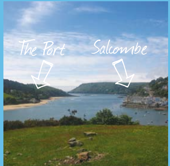
- View from Snapes Point