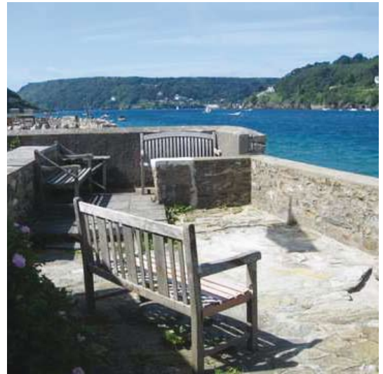
- The Port terrace

There are plenty of unspoilt sandy beaches that stretch out in front of The Port.