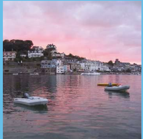
- A Salcombe sunset