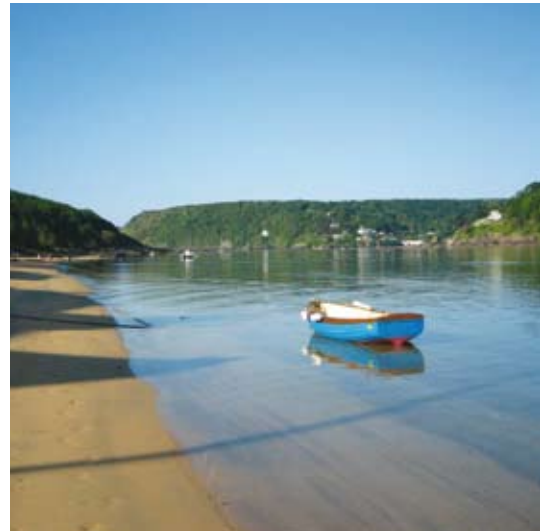
- The perfect place to relax...