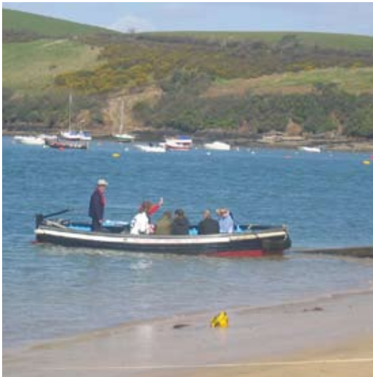
- The ferry to Salcombe