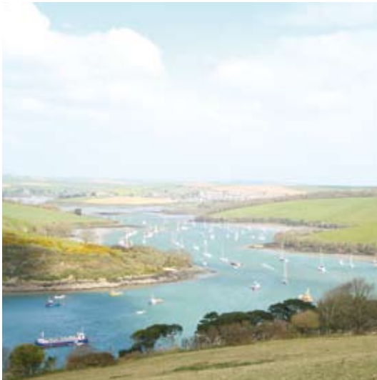
- Plenty of exhilarating walks